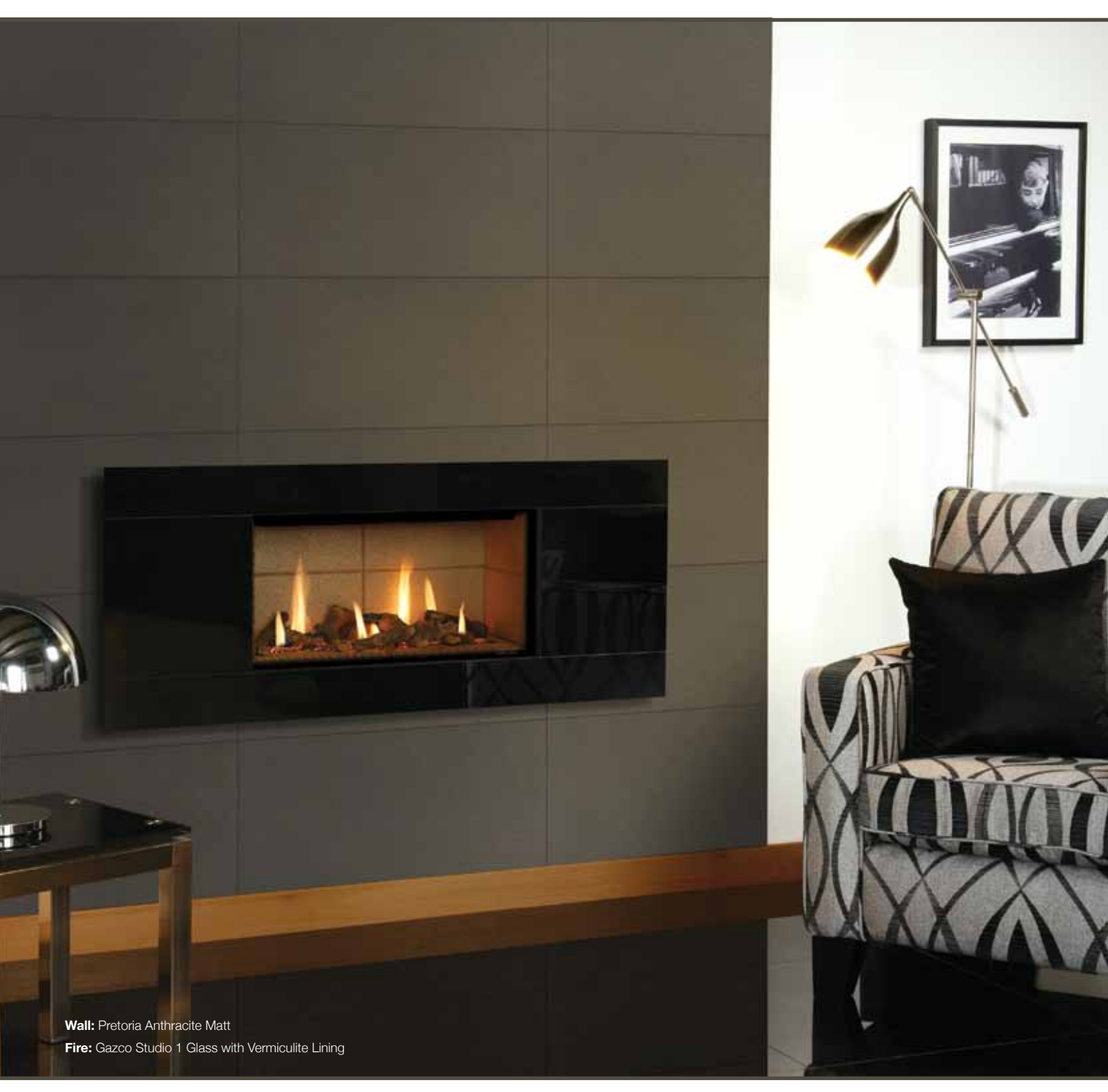
Also see image on page 3