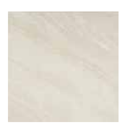
Slate Chiara Bianco 60 x 60 x 1cm