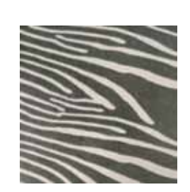
Cavallino Zebra 45 x 45 x 0.9cm